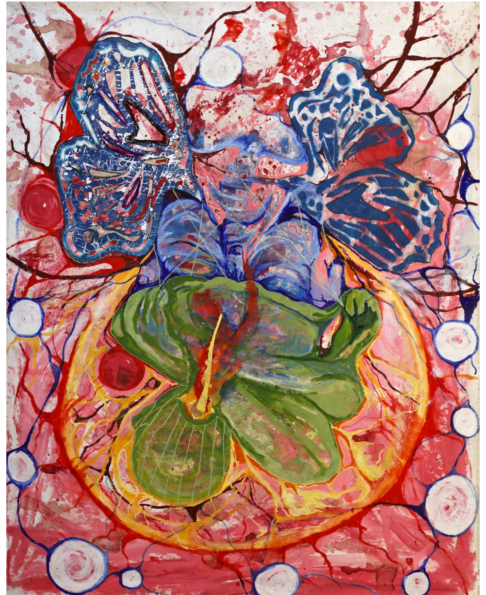
Amai Ndakanaka Amai, Part 1 & 2, 2019 Acrylic, oil and stitching on canvas 220cm x 172cm each