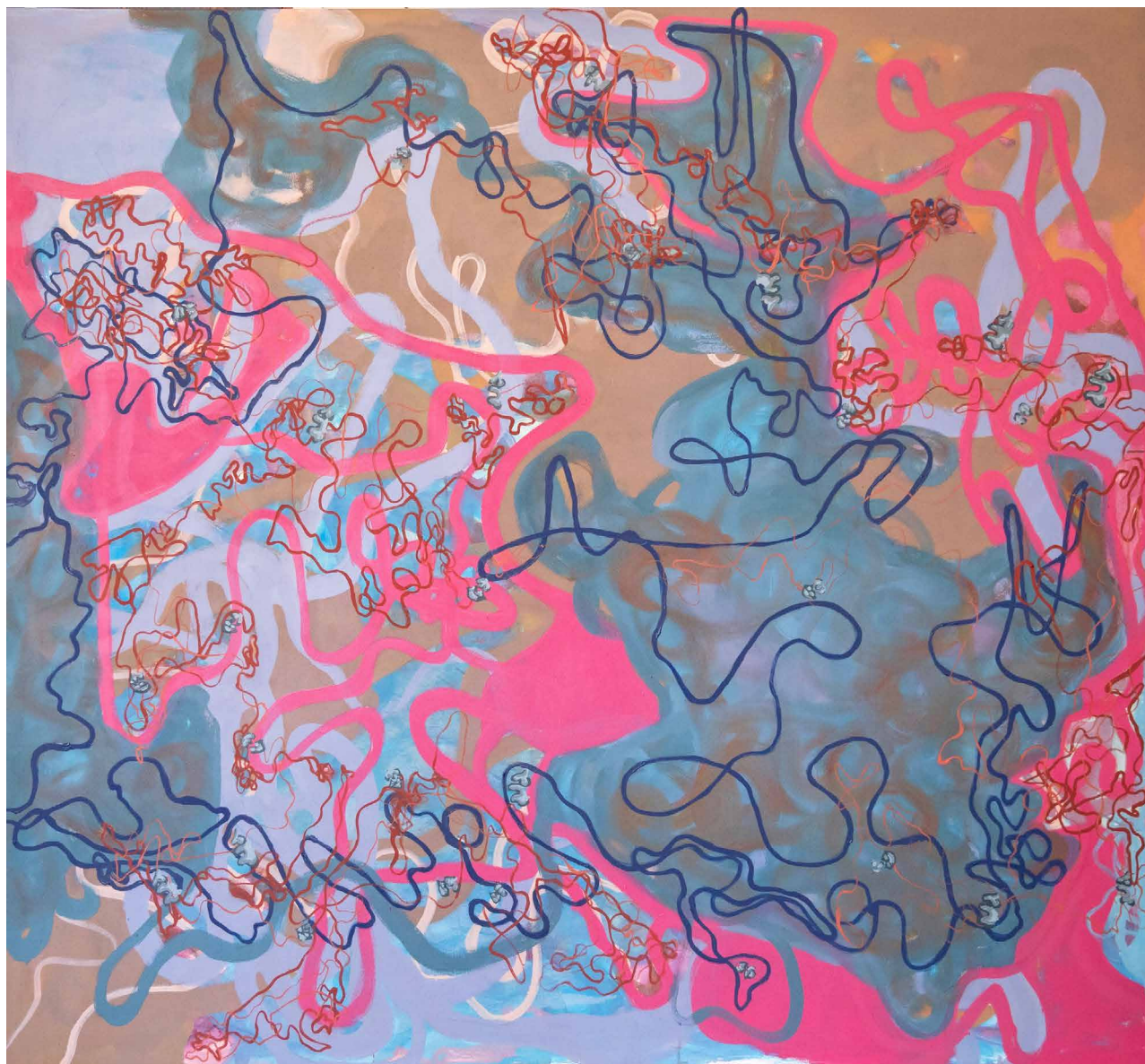
Ngabangani bami but me not slay, 2019 Oil on canvas 170cm x 185cm