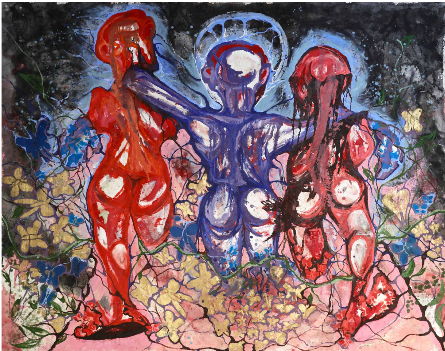
My Sister's Keeper, 2019 Acrylic, oil and stitching on canvas 220cm x 280cm