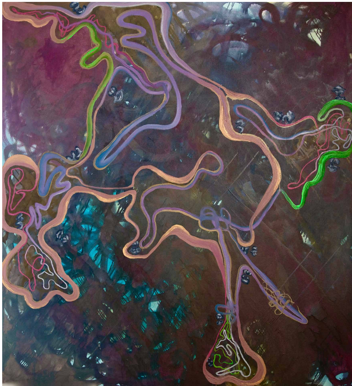
On a shiny day the queens not celebrating, 2019 Oil on canvas 185cm x 170cm