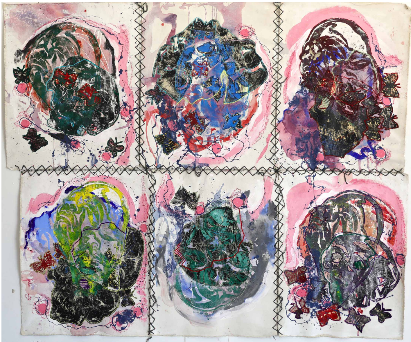
The Good, Bad, Ugly and Beautiful, 2019 Acrylic, oil and stitching on canvas 146cm x 175cm