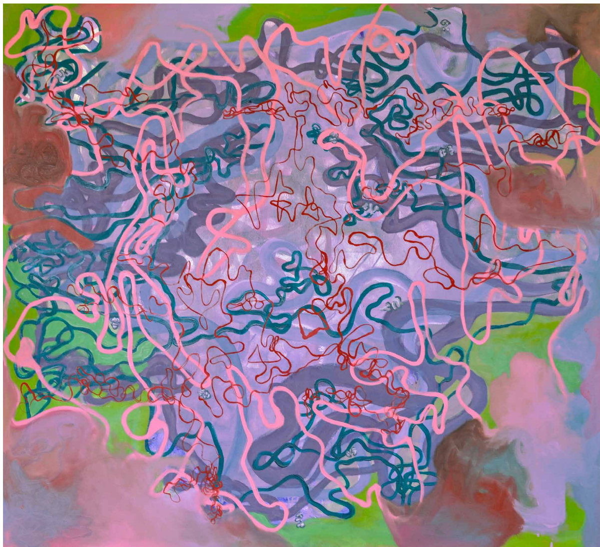
Calling on my private number, 2019 Oil on canvas 170cm x 185cm