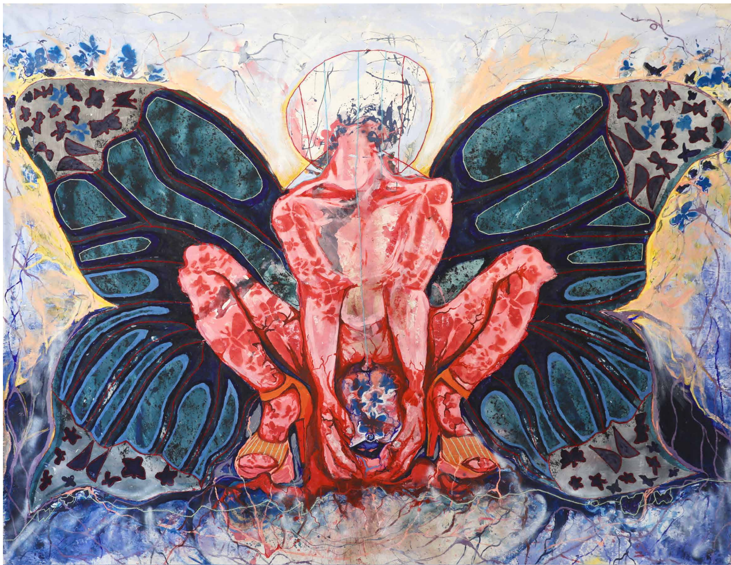
Dai Ndine Mapapiro(i wish i had wings), 2019 Acrylic, oil and stitching on canvas 220cm x 280cm