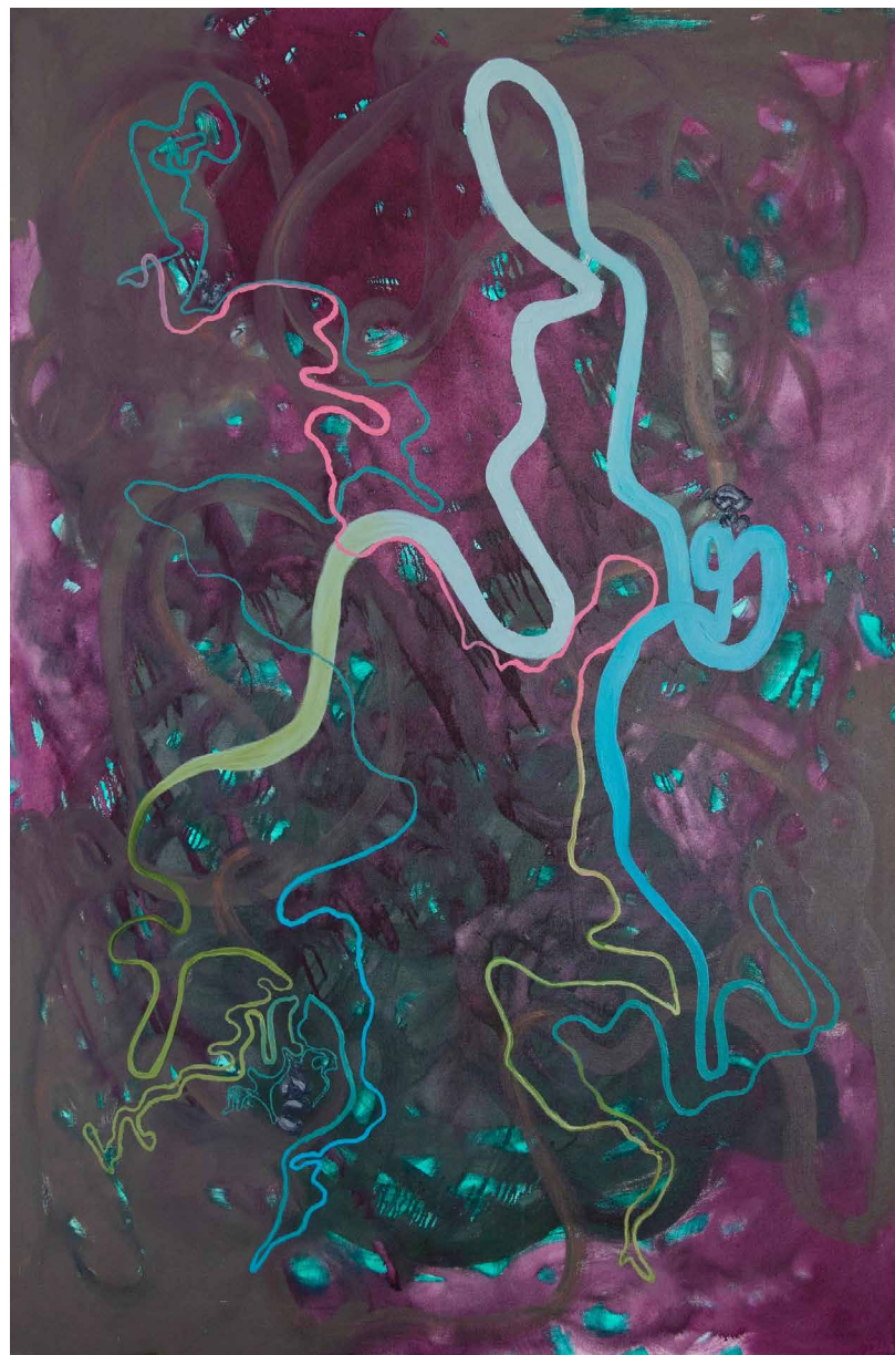
Whatsapp Gold, 2019 Oil on canvas 180cm x 120cm