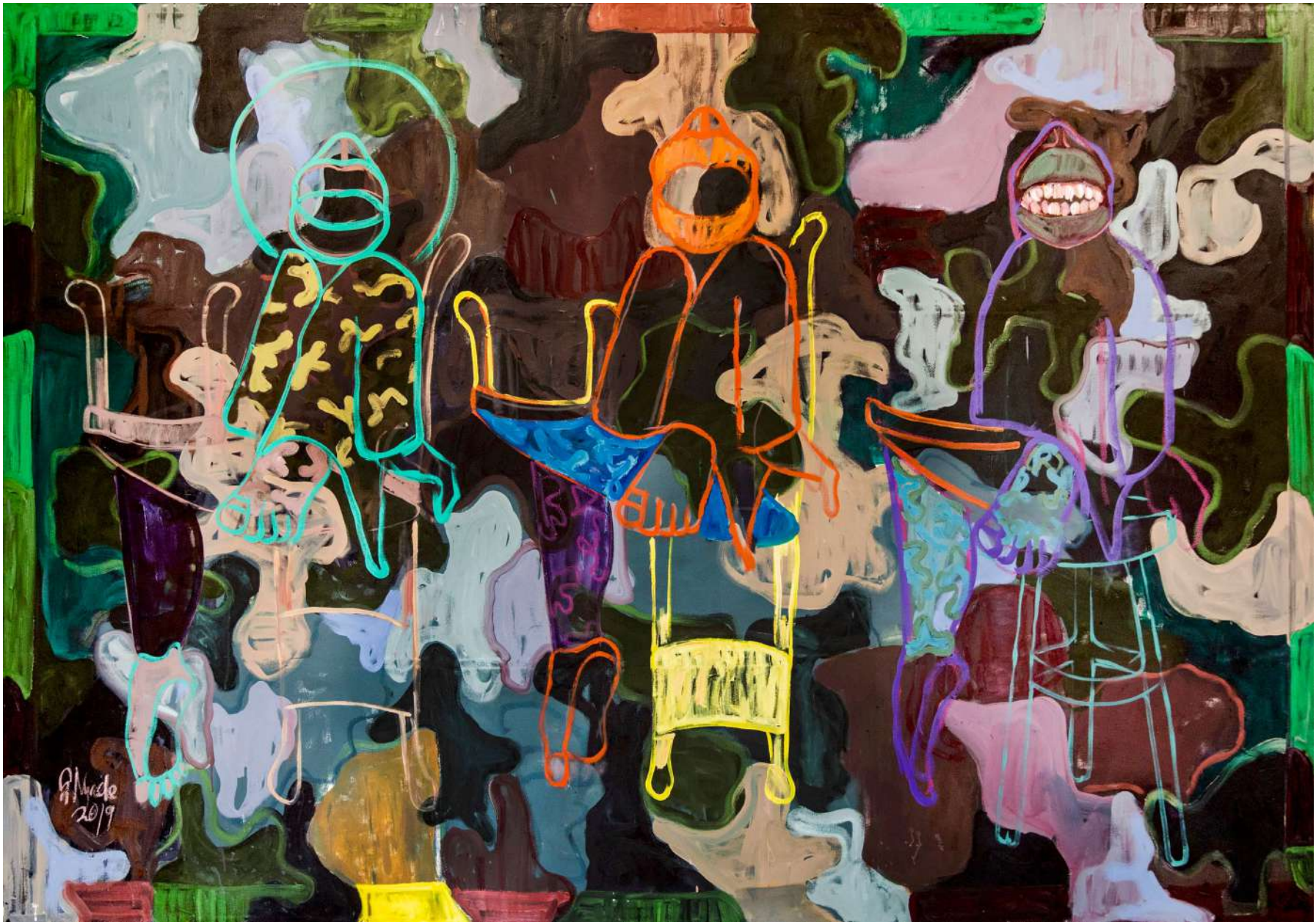
Blessings of the Bedridden, 2019 Oil on canvas 210cm x 299cm