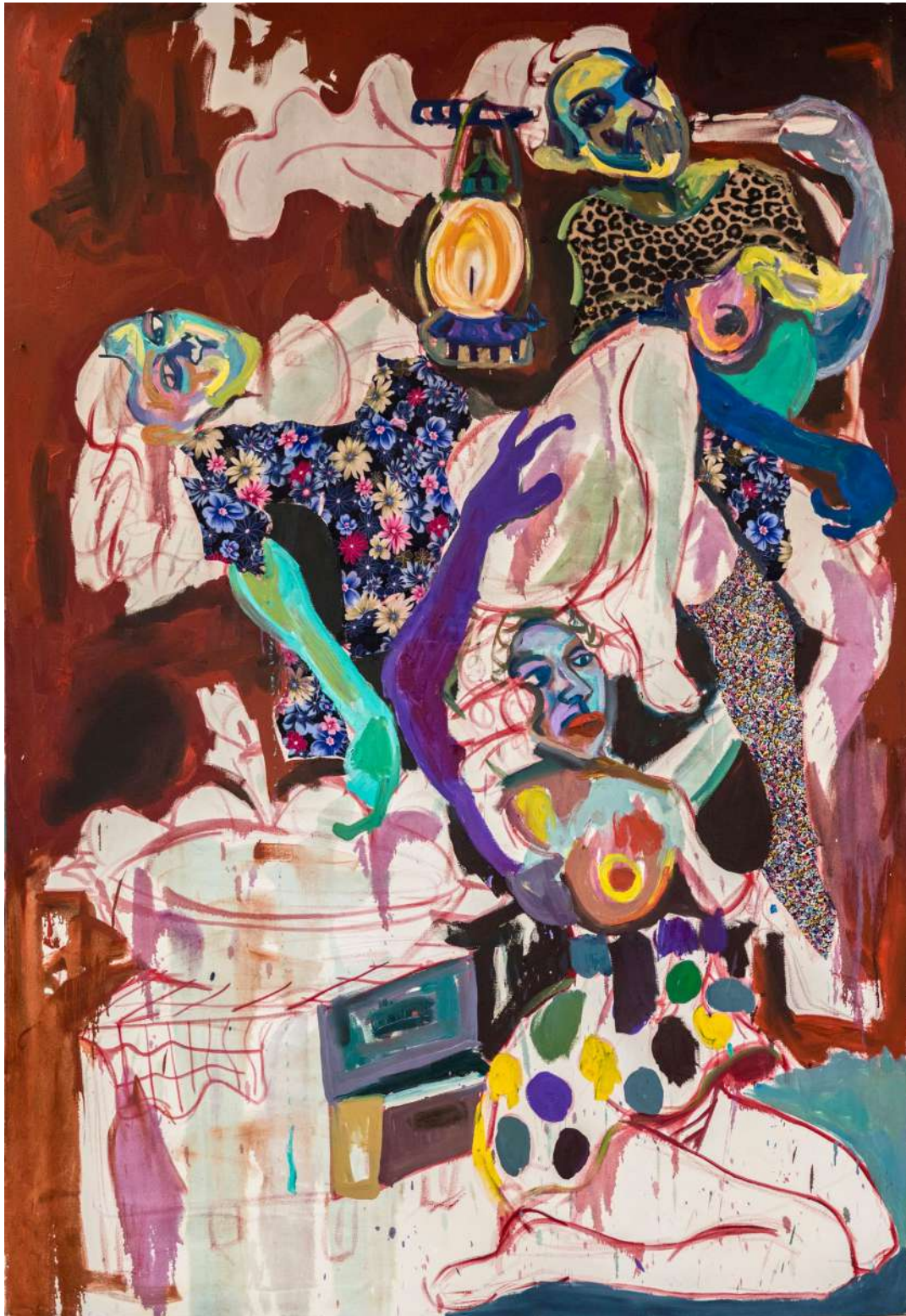
The Torn and the Soothed, 2019 Oil and fabric collage on canvas 247cm x 175cm