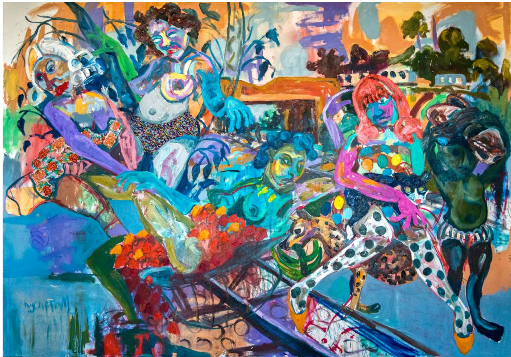
No Fear of Living, 2019 Oil and fabric collage on canvas 210cm x 299cm