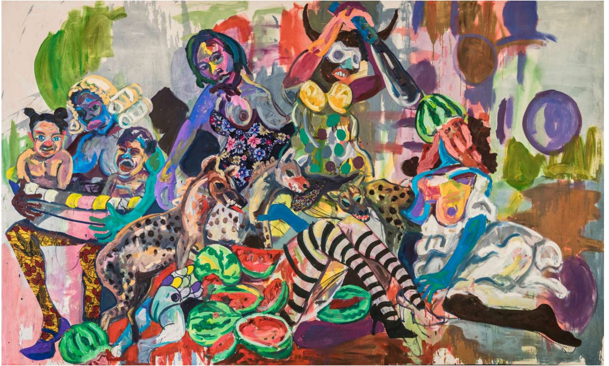
No fear of falling, 2019 Oil and fabric collage on canvas 210cm x 350cm