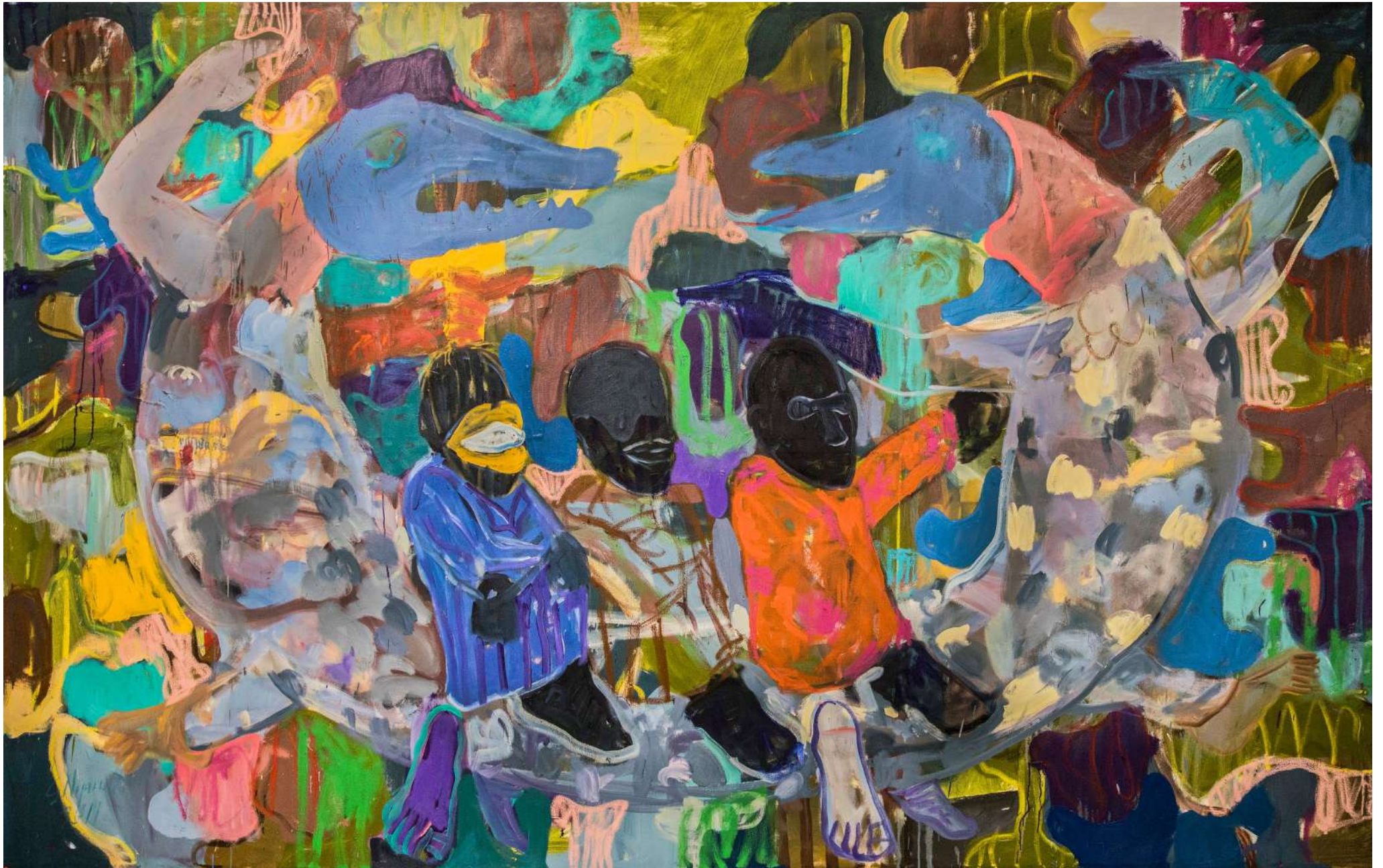
Life in our own hands? 2019 Oil on canvas 210cm x 350cm