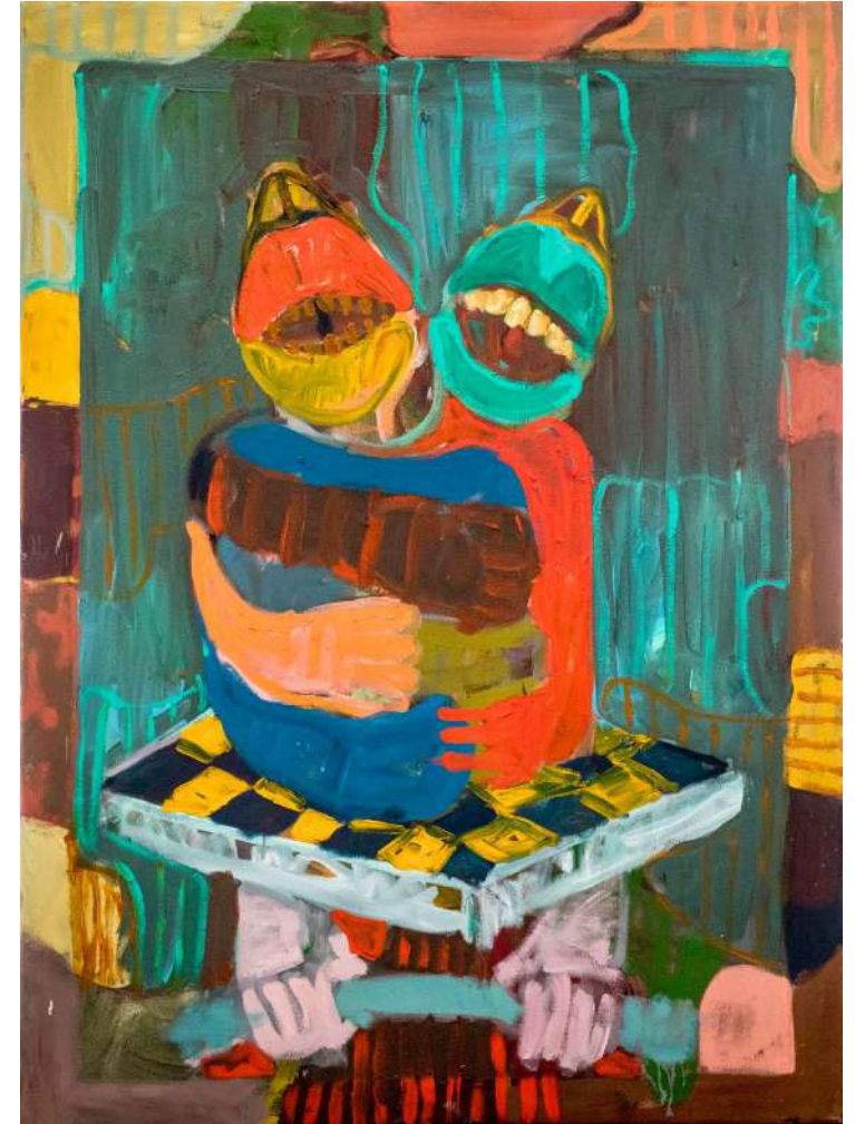
Someone is watching, always, 2019 Oil on canvas 150cm x 110cm

Defying the Narratives, Ever Gold Projects, San Francisco, USA 2019 Ex africa semper aliquid novi - Sa Bassa Blanca Museum | Yannick & Ben Jakober Foundation, Mallorca, Spain 2018 Songs for Sabotage at New Museum Triennial (New York, 2018) Mazino at First Floor Gallery Harare (Harare, Zimbabwe, 2017) Face the Magic at Loving | Monro (Los Angeles, 2017) Cape Town Art Fair with First Floor Gallery Harare (Cape Town, South Africa, 2017).