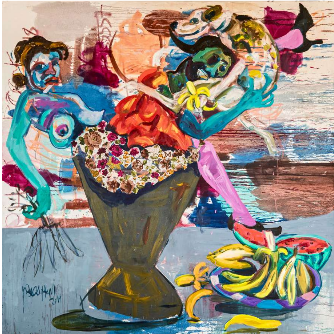
My cup is full, 2019 Oil and fabric collage on canvas 210cm x 210cm