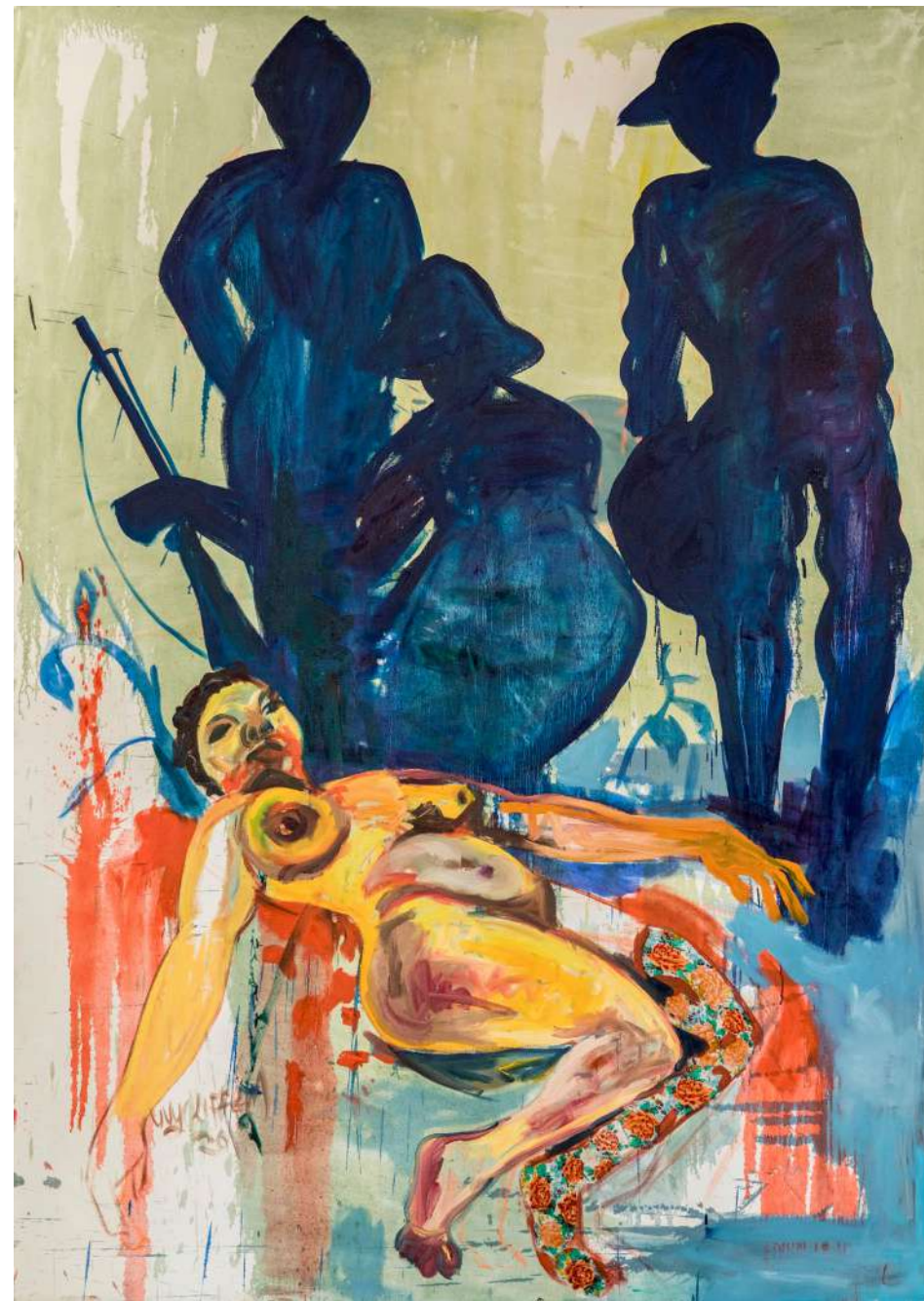
The life you bleed, 2019 Oil and fabric collage on canvas 247cm x 175cm

Kubatana, Vestfossen Kunstlaboratorium, Oslo, Norway Harare Fauves, Alon Segev Gallery, Tel Aviv, Israel Tomorrows/Today solo: Cape Town Art Fair 2018 with First Floor Gallery Harare (Cape Town, South Africa) Right at the Equator (Depart Foundation, Los Angeles, USA) Another Antipodes /urban axis 2017 (PS1 Art Space, Freemantle, Australia) Flaunt, Africa New Wave Now at Ethan Cohen Fine Arts (New York).